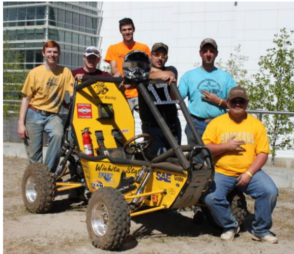
Greenville, South Carolina 2010