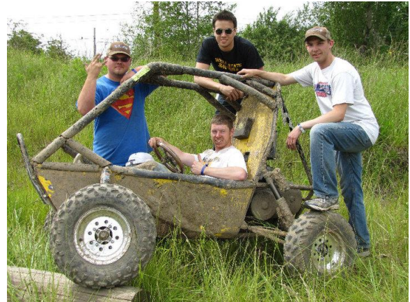
Bellingham, Washington 2010