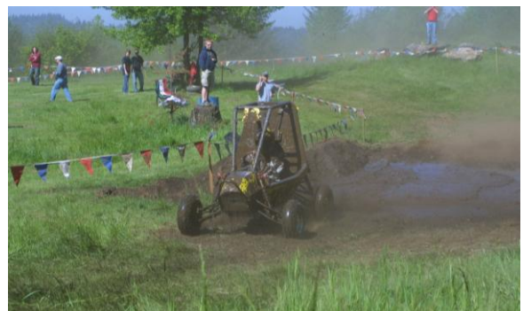
Wisconsin Baja, Wisconsin 2008