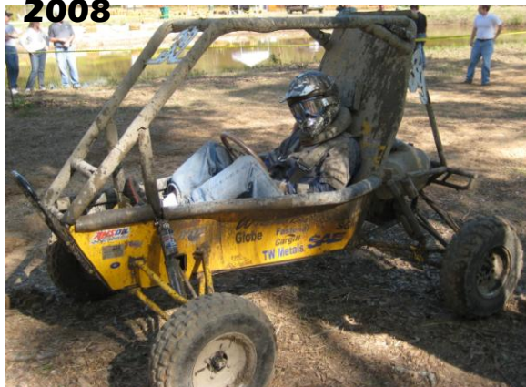
Wisconsin Baja, Wisconsin 2008