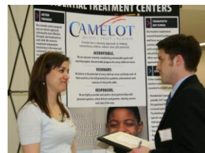
Social Work Career Fair, April 9