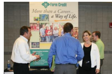
Spring Career Fair, March 5