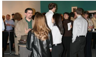
The Art of Networking, February 26

Health Professions Career Fair, February 9 Education Interview Day, February 16