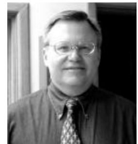
Lloyd Harp Classified Senator

Lloyd currently serves on the committee researching the possibilities of alternatives to the state civil service system. He believes that being directly involved in changing