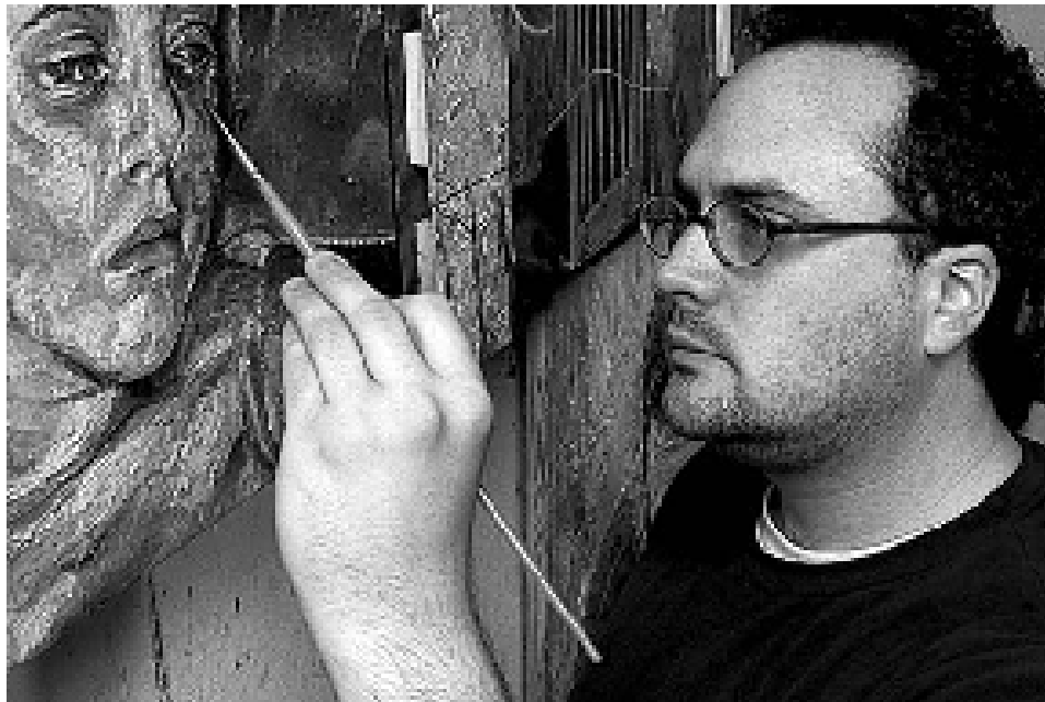
Students in WSU's art and design programs have the opportunity to exhibit their work in the Clayton Staples Gallery.

Departures from the rules and regulations stated in the Graduate Catalog require the filing and approval of a Request for Exception to Graduate School Regulations form. Such requests must have the approvals indicated on the form and must state in a logical and coherent manner a rational basis for the requested exception. Forms for such requests are available from the Graduate School and graduate program areas and may be downloaded from the Graduate School Web site. Unusual and/or substantial deviations from stated rules and regulations require action by the Graduate Council.