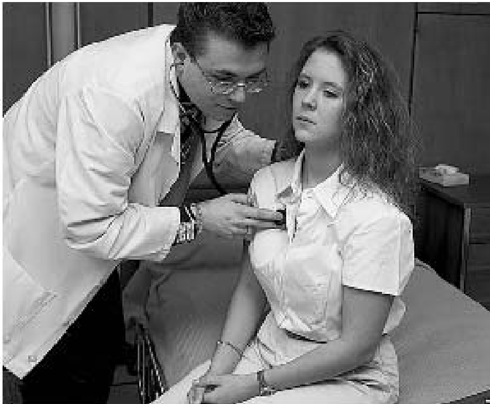
Students in WSU's College of Health Professions are placed in jobs at an exceptional rate. The graduate program in physician assistant studies is the only one of its kind in Kansas.

Graduate coordinators may also serve on graduate committees in their programs or academic colleges.